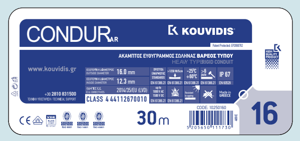
Label found on conduit bundles or coils

All KOUVIDIS products have distinctive labelling on their packaging and are easily traceable. The color of the label indicates the type of the product while the information mentioned refer to its characteristics and mechanical strengths.