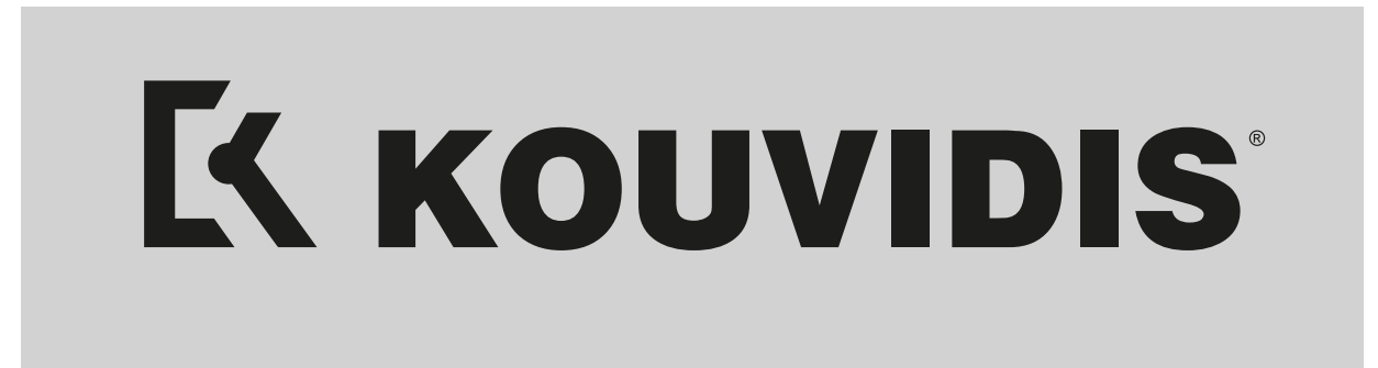
Safe clear space